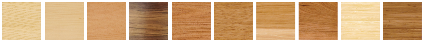
Ash Maple Beech Walnut Red Oak White Oak Hickory Cherry Natural Bamboo Caramelized Bamboo

*Natural wood products vary in color and grain. Due to differences in printing, actual color may differ from images above.