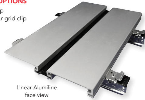
Linear Alumiline face view

Direct attach clip 15/16" HD T-Bar grid clip